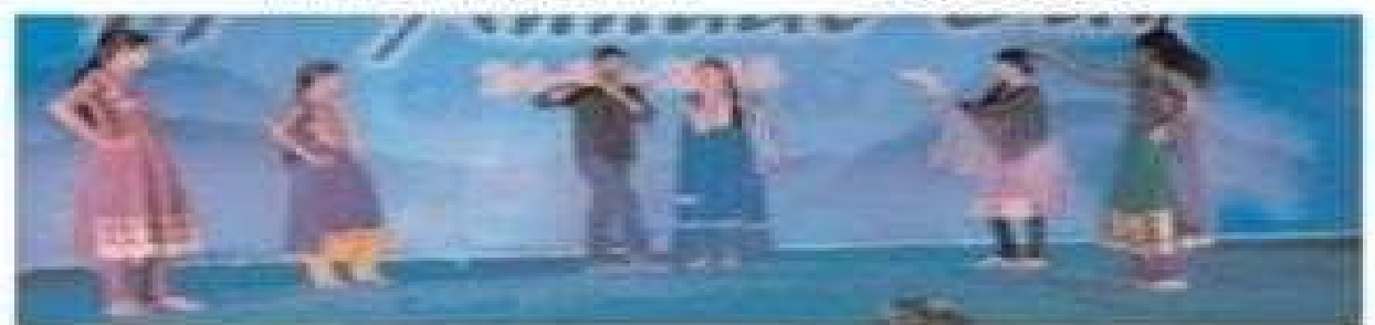
Students performing cultured programmers at MITS annual day celebrations